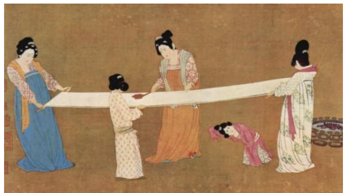
Song Dynasty women inspecting a bolt of silk. 12th century CE. Painted on silk.

What does this illustration tell us about the Song Dynasty?