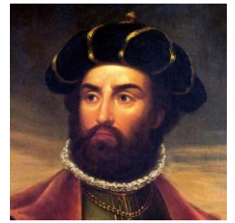
Vasco da Gama

Portuguese explorer Vasco da Gama sailed south and then east.