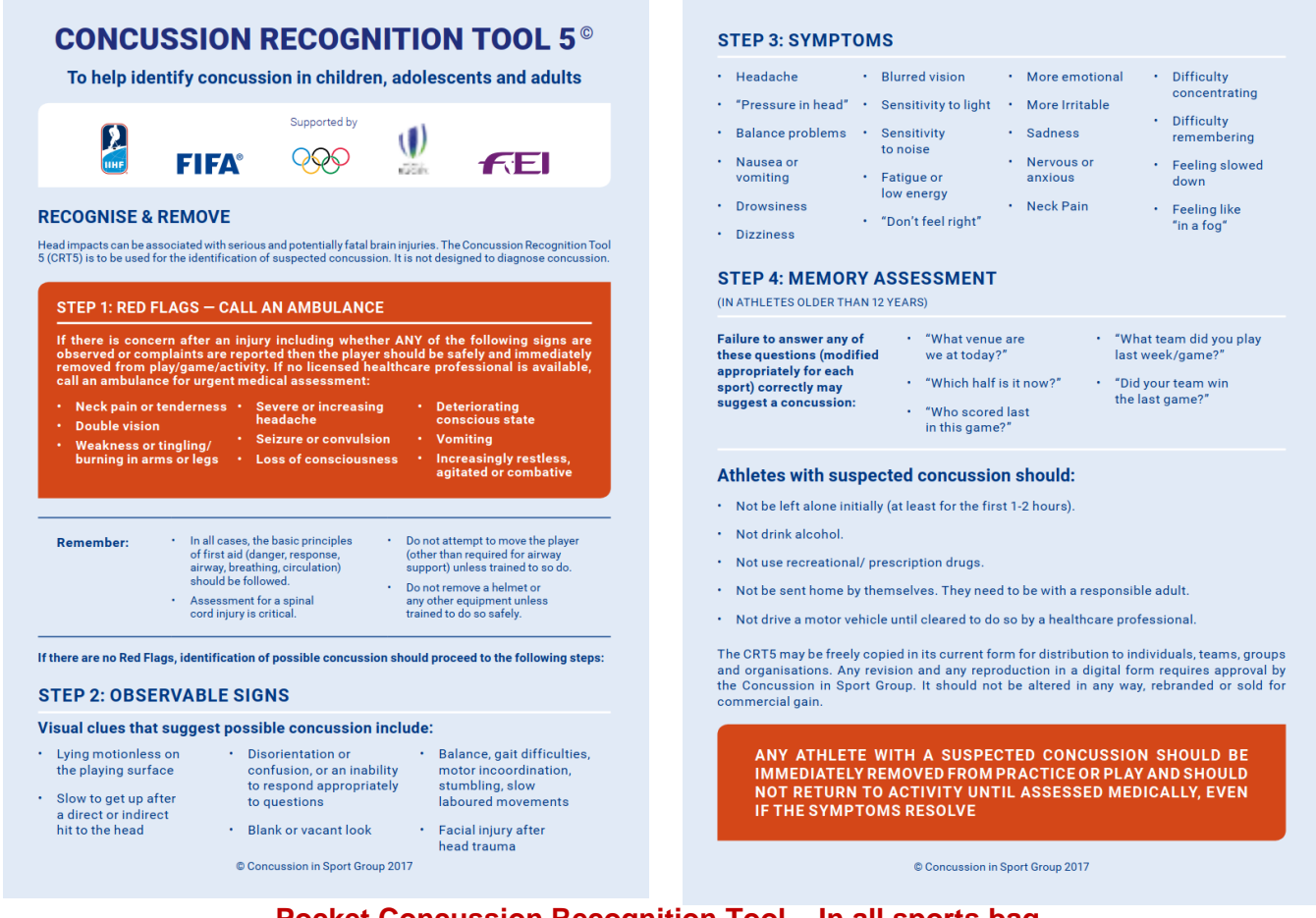
Pocket Concussion Recognition Tool - In all sports bag